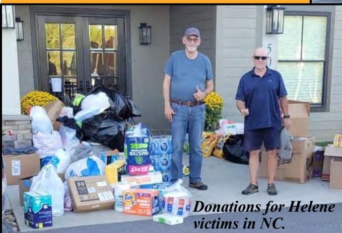
Donations for Helene victims in NC.